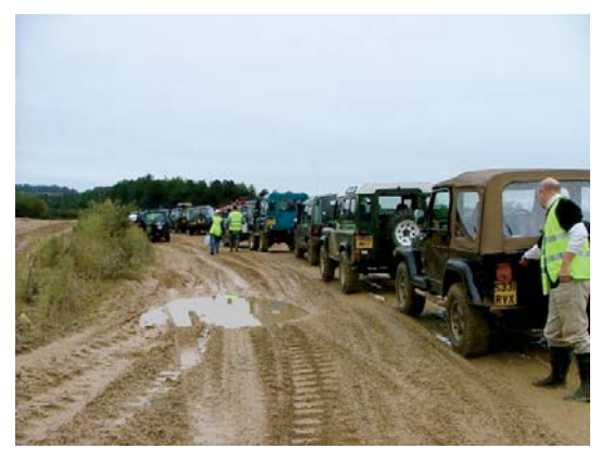
Waiting for the off!

The committee of the club would like to say thank you to all the volunteers this year and hope to see you next year!