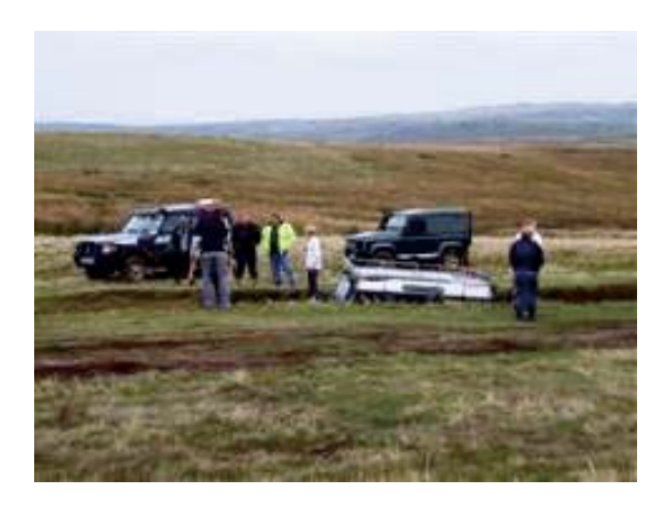
But boy didn't he really get stuck in!